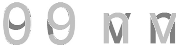
Fig. 2. Illustration of physical overlap (cross-correlation) between symbols. On the left we have overlaid an Arial font '9' (dark grey) on '0', and '0' (dark grey) on '9'; these symbols have a very high cross-correlation of 0.85. On the right an illustration of overlaying 'v' (dark grey) with 'n', and 'n' (dark grey) on 'v', respectively; these two letters have a quite low cross-correlation of 0.37.

There are many ways to compare the image properties of letters and digits – for example, one might count absolute strokes per symbol or the number of curved vs. straight strokes. To avoid making any a priori assumptions on how to carve up the symbols, we computed letter and digit image-based similarity using one of the simplest methods for template matching and similarity estimation: normalized cross-correlation (Lewis, 1995). To do so, we cross-correlated each pair of symbol images, and found the peak of the cross-correlation map, that is, the horizontal/vertical translation of one image with respect to the other that maximizes their alignment. We then recorded the respective correlation coefficient (i.e., degree of overlap between the two images, see Fig. 2a) as an estimate of similarity: the higher the correlation, the more similar the images of the two symbols. This provides an estimate of maximal similarity between two symbols, and the cross-correlation coefficient can be thought of as the worst-case scenario when discrimination of a symbol from its competitors is most difficult. This analysis was done separately for letters and digits displayed in high contrast (black against white background) and it was done for two